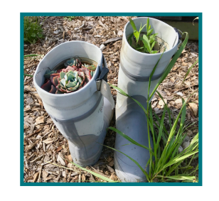
An "upcycled" garden