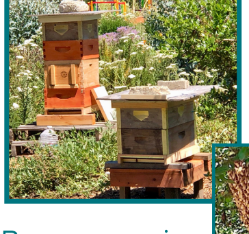
Bees swarming and in hives